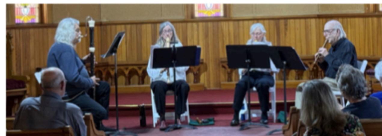
Four Friday Fiddle Flute Friends