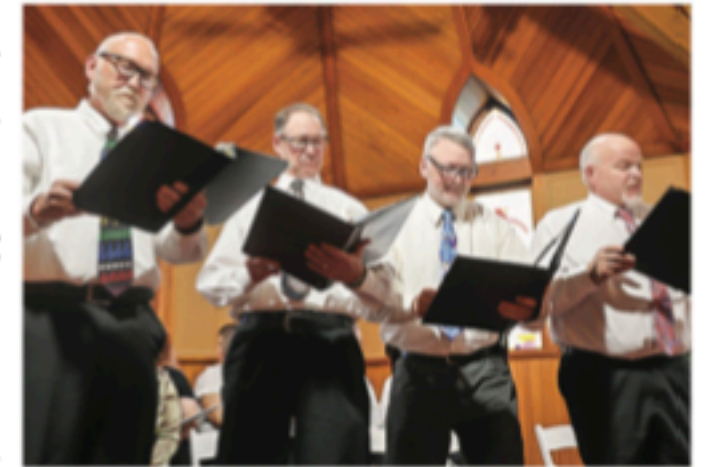
Members of the Sectionals singing group perform a Sea Shanty tune during the entertainment segment of Midsummer in St. Mary's historic hall