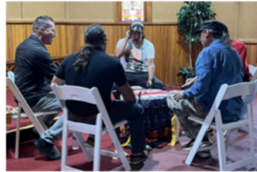
Night Sky Singers