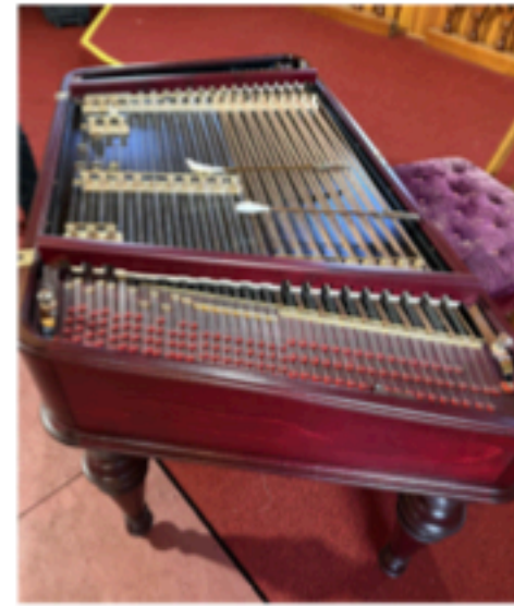
The Cimbalom, a rare instrument fascinated the audience