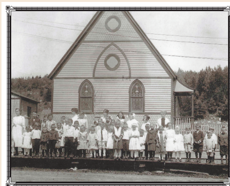
Above: A group of 38 Sunday School children and several teachers in the early 1920's dressed in their finery pose outside of St. Mary's Episcopal Church at its original location in Tower, MN.

We are a 501(c)(3) nonprofit and are tax exempt. Please consider a donation or annual pledge to the Lake Vermilion Cultural Center and help bring our vision to completion. vermilionculturalcenter.org